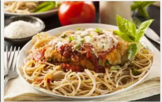
National Chicken Parmesan Day