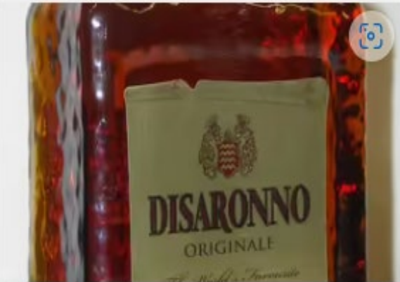
National Amaretto Day