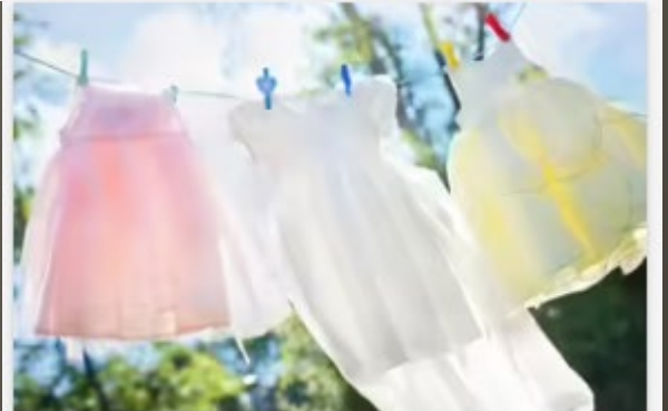
National Hanging Out Day

As we wait for the WIT Town Hall to begin– please share in the chat.... How are you celebrating April 19th?