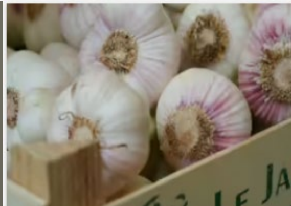
National Garlic Day