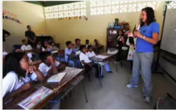
Education and Sharing Day